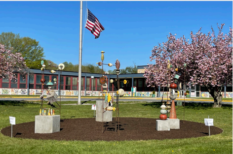
COMMUNITY ART INSTALLATION